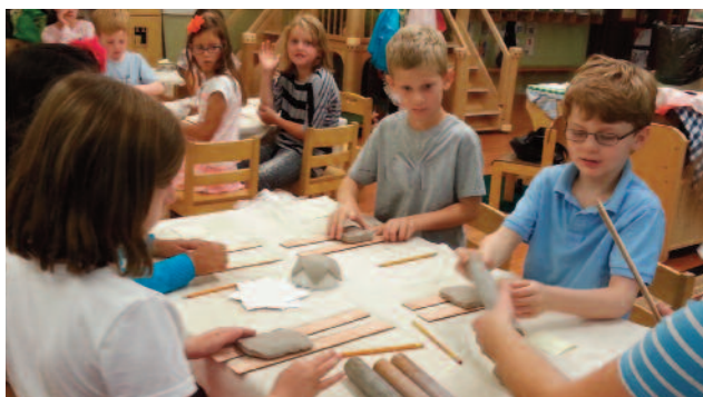
K-3rd graders creating chalices Sept. 21st (glazing on Oct 5 & 12)