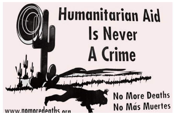
Members of No More Deaths have been charged with "Littering" for leaving plastic gallon containers of water on the trails that migrants travel.

When the drug cartel burns down your house, you leave. When your son is kidnapped and a piece of his finger is sent to you, you somehow come up with the money and you leave. When you finish your shift at your $9 a day factory job and your "taxed" (extortion) by the gangs, you leave. These are the stories that I heard. The question isn't why so many people are heading north, it's why are there so few?