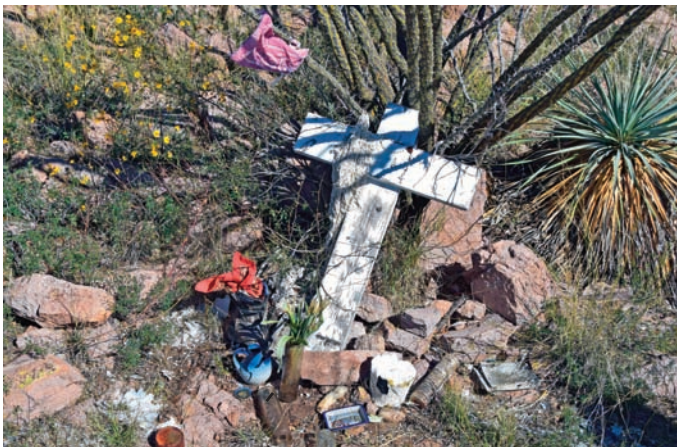
A shrine in the Sonora desert not far from where the body of a dead woman was found