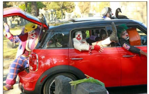
We’re not sure which member of UGNO this is, but we’re grateful for all the friends he brought on October 5th.